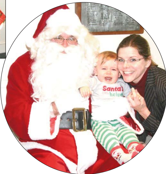
Holiday Party

You'd think it was Thanksgiving all over again from the many "Thanks" I've mentioned. But seriously, without our kids we couldn't call it a Kids Christmas party. Without parents we wouldn't have kids, without grandparents we wouldn't have parents or kids or uncles or aunts, and without friends we wouldn't have friends of friends. So thanks to all in making this wonderful occasion a success! What a great kick-off it was to the holiday season. Happy New Year and only Great Wishes for 2012!!