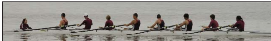
Additional Commissioning Day photos - next page!