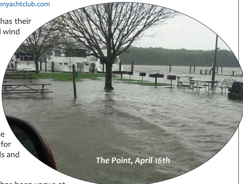
The Point, April 16th

Extreme tides backed up by flood waters and winds from the south and east have loaded the marina with drift wood. In fact flood waters covered the point on April 16th loading up the grounds with debris only a week after cleanup day. Volunteers that arrived the next day to help deploy our no wake buoys and channel marker also pitched in to start cleaning up a lot of the wood. I would like to recognize Glenn Stone and his entire family and Jim Gordon for removing a huge amount of debris from the bulkheads and parking lot on Sunday.